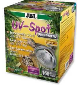
JBL UV-Spot plus UV spotlight with daylight spectrum for terrariums