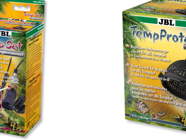
JBL TempProtect light Reptile thermal burn protection for JBL TempSets