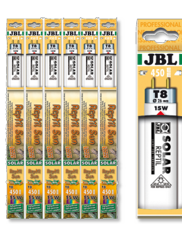
JBL SOLAR REPTIL SUN T8

T8 terrarium fluorescent tube for rainforest animals