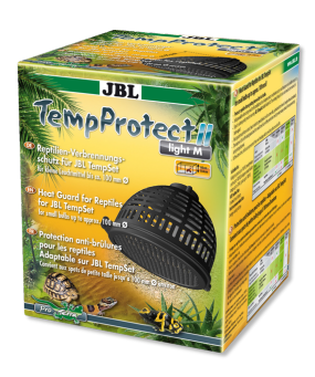
JBL TempProtect II light Reptile thermal burn protection for JBL TempSet items