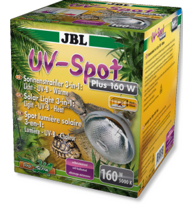
JBL UV-Spot plus UV spotlight with daylight spectrum for terrariums