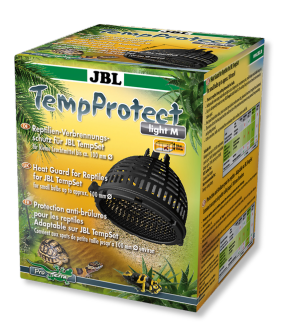
JBL TempProtect light Reptile thermal burn protection for JBL TempSets