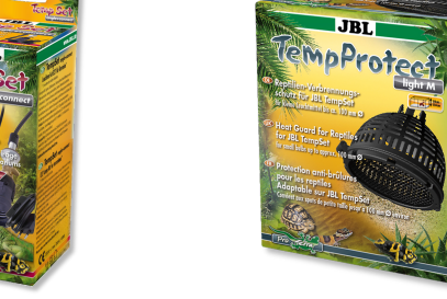
JBL TempProtect light Reptile thermal burn protection for JBL TempSets