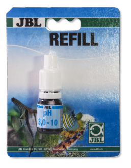
JBL pH Test 3.0-10.0 Quick test to determine the acidity