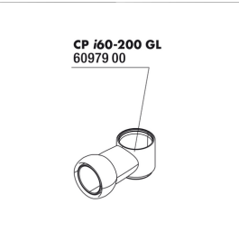
JBL CP i greenline water outlet pipe