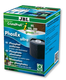
JBL PhosEx Ultra CristalProfi i60/80/100/200 Phosphate remover cartridge for JBL CristalProfi i