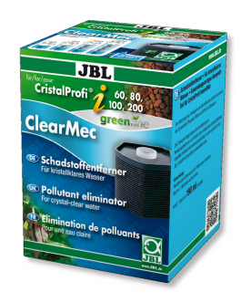
JBL Clearmec CristalProfi i60/80/100/200 Nitrite, nitrate and phosphate eliminator for CP i