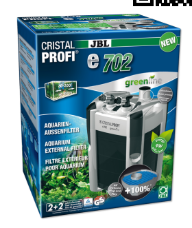
JBL CRISTALPROFI e702 greenline External filter for aquariums from 60-200 litres