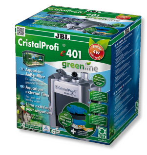
JBL CristalProfi e401 greenline External filter for aquariums of 40-120 litres