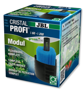
JBL CRISTALPROFI i greenline module Filter module for internal filter series CristalProfi i