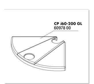
JBL CPi greenline Pump HC