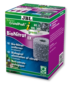
JBL BioNitrat Ex CristalProfi i60/80/100/200

Active peat granulate for CristalProfi i