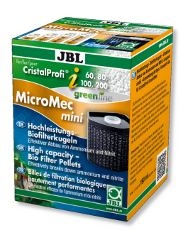
JBL MicroMec CristalProfi i60/80/100/200

High-performance filter balls for CristalProfi i