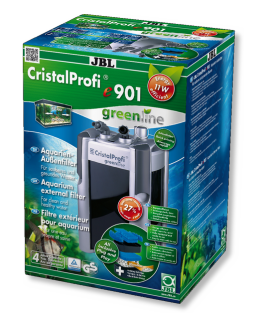
JBL CristalProfi e901 greenline External filter for aquariums

External filter for aquariums from 90 - 300 litres