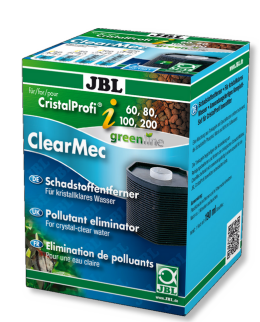
JBL Clearmec CristalProfi i60/80/100/200

Phosphate remover cartridge for JBL CristalProfi i