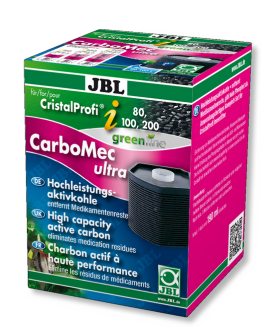
JBL CarboMec ultra Pad CristalProf i60/80/100/200

High-performance filter balls for CristalProfi i