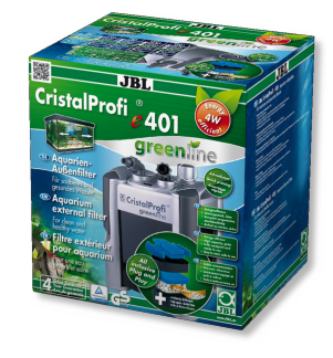
JBL CristalProfi e401 greenline

External filter for aquariums from 90 - 300 litres