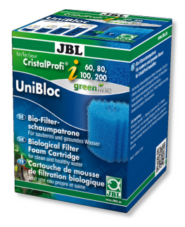
JBL UniBloc CristalProfi i60/80/100/200

Biological nitrate remover for CristalProfi i filters