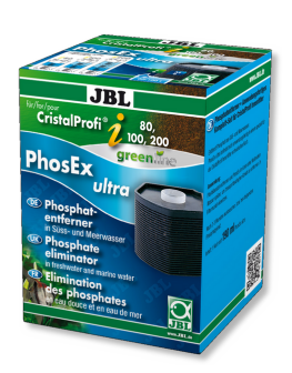
JBL PhosEx Ultra CristalProfi i60/80/100/200

Filter insert with activated carbon for CP i range