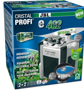
JBL CRISTALPROFI e402 greenline

External filter for aquariums of 40-120 litres