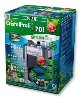
JBL CristalProfi e701 greenline External filter for aquariums from 60 - 200 litres