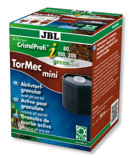
JBL Tormec CristalProfi i60/80/100/200

Nitrite, nitrate and phosphate eliminator for CP i