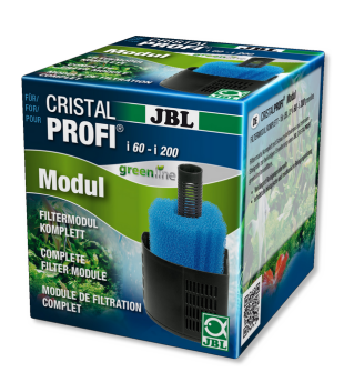
JBL CRISTALPROFI i greenline module

Water outlet with wide jet pipe for internal filters