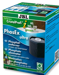
JBL PhosEx Ultra CristalProfi i60/80/100/200 Phosphate remover cartridge for JBL CristalProfi i