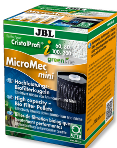
JBL MicroMec CristalProfi i60/80/100/200 High-performance filter balls for CristalProfi i