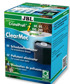
JBL Clearmec CristalProfi i60/80/100/200 Nitrite, nitrate and phosphate eliminator for CP i