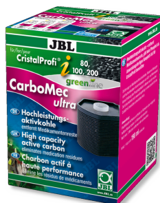
JBL CarboMec ultra Pad CristalProfi i60/80/100/200 Filter insert with activated carbon for CP i range