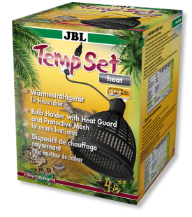
JBL TempSet Heat Install. kit with ceramic bulb holder for heat radiator