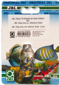
JBL Clips T5/T8 (Metal) Metal holder für fluorescent tubes