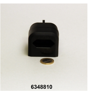
JBL adapter UK for all flat-pin plugs