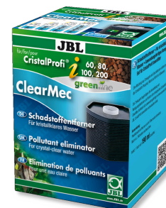
JBL ClearMec CristalProfi i60/80/100/200

Phosphate remover cartridge for JBL CristalProfi i