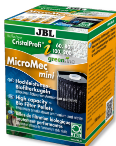
JBL MicroMec CristalProfi i60/80/100/200

High-performance filter balls for CristalProfi i