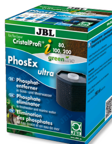
JBL PhosEx Ultra CristalProfi i60/80/100/200

Filter insert with activated carbon for CP i range