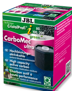
JBL CarboMec ultra Pad CristalProfi i60/80/100/200

High-performance filter balls for CristalProfi i