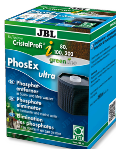
JBL PhosEx Ultra CristalProfi i60/80/100/200

Filter insert with activated carbon for CP i range