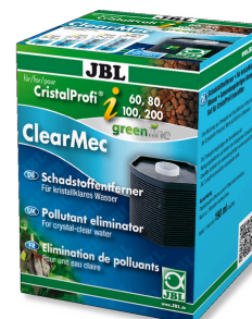
JBL ClearMec CristalProfi i60/80/100/200

Phosphate remover cartridge for JBL CristalProfi i