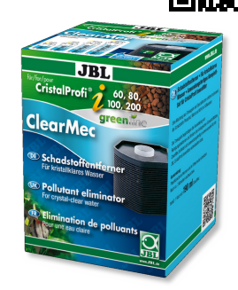
JBL Clearmec CristalProfi i60/80/100/200 Nitrite, nitrate and phosphate

Phosphate remover cartridge for JBL CristalProfi i