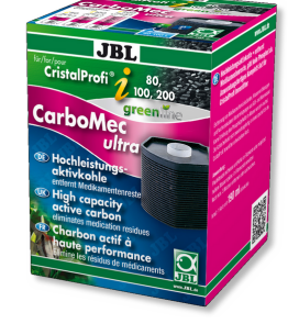
JBL CarboMec ultra Pad CristalProf i60/80/100/200 Filter insert with activated carbon for CP i range