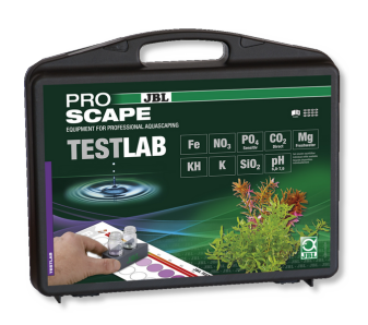
JBL Testlab ProScape Test case for water analysis in plant aquariums