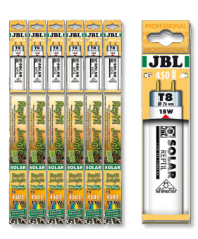
JBL SOLAR REPTIL JUNGLE T8

T8 terrarium fluorescent tube for rainforest animals