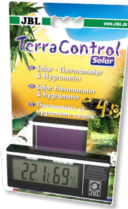
JBL TerraControl Solar Solar-powered thermometer + hygrometer for terrariums