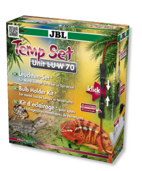
JBL TempSet Unit L-U-W Installation kit for metal-halide lamps