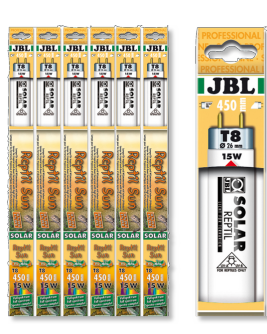
JBL SOLAR REPTIL SUN T8

T8 terrarium fluorescent tube for rainforest animals