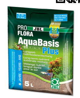
JBL PROFLORA AquaBasis plus Long-lasting nutrient substrate f. freshwater aquarium