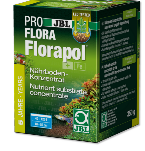
JBL PROFLORA Florapol Long-term nutrient substrate concentrate