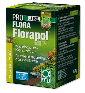
JBL PROFLORA Florapol Long-term nutrient substrate concentrate