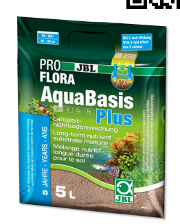
JBL PROFLORA AquaBasis plus Long-lasting nutrient substrate f. freshwater aquarium