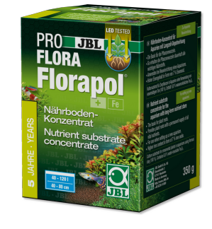
JBL PROFLORA Florapol Long-term nutrient substrate concentrate