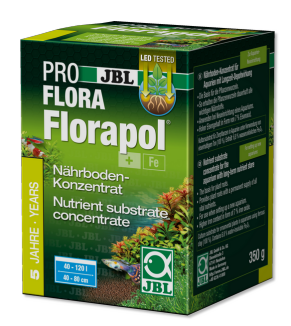
JBL PROFLORA Florapol Long-term nutrient substrate concentrate

Root fertiliser for freshwater aquariums