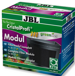
JBL CristalProfi m greenline Module Filter module to extend CristalProfi m