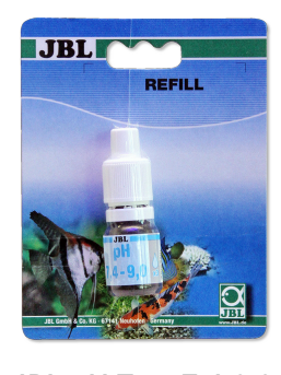
JBL pH Test 7.4-9.0 pH test in aquariums and ponds in the range 7.4-9.0