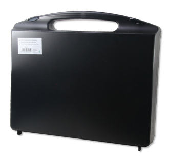
JBL component set for water tests