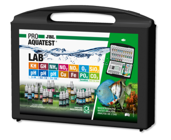
JBL PROAQUATEST LAB

Test case with most important water tests + NH4 test