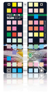
JBL ProScan ColorCard