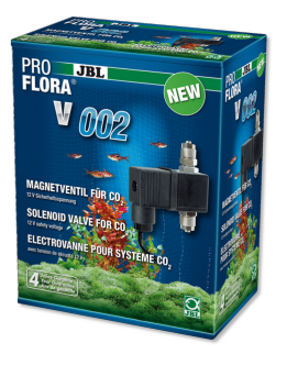
JBL PROFLORA v002 Noiseless solenoid valve

Fitting to reduce pressure for 2 CO2 diffusers