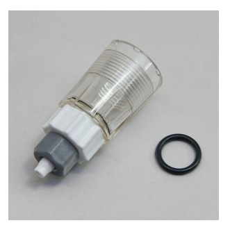
JBL PF Direct bubble counter