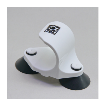
JBL PF Direct mounting, complete