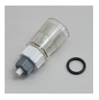
JBL PF Direct bubble counter