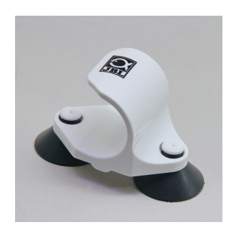
JBL PF Direct mounting, complete