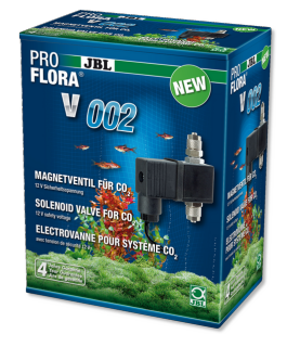
JBL PROFLORA v002 Noiseless solenoid valve