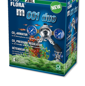
JBL PROFLORA m001 duo Fitting to reduce pressure for 2 CO2 diffusers