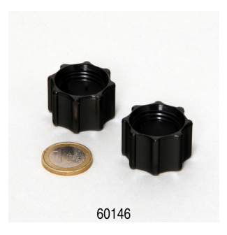
JBL CP e union nut for hose connection