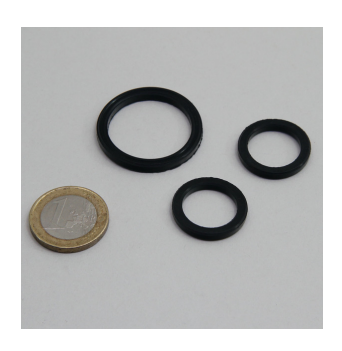
JBL PF Direct seal set