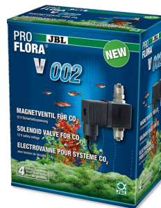
JBL PROFLORA v002

Fitting to reduce pressure for 2 CO2 diffusers