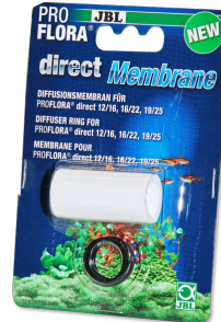
JBL PROFLORA Direct Membrane 12/16,16/22,19/25 Replacement diaphragm for ProFlora Direct