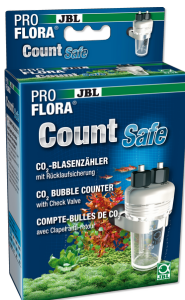
JBL PROFLORA CO2 Count Safe