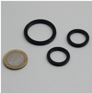
JBL PF Direct seal set