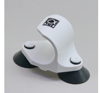
JBL PF Direct mounting, complete