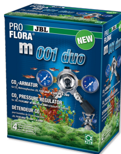
JBL PROFLORA m001 duo

Fitting to reduce pressure for 2 CO2 diffusers