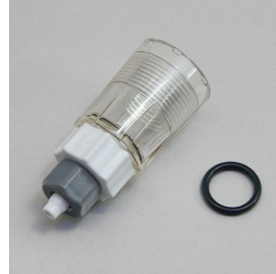
JBL PF Direct bubble counter