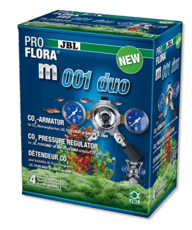
JBL PROFLORA m001 duo Fitting to reduce pressure for 2 CO2 diffusers