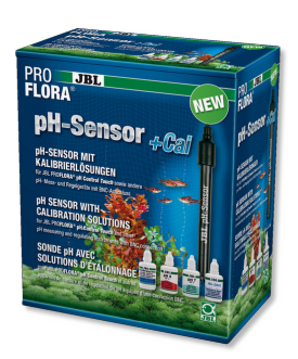
JBL PROFLORA pH-Sensor+Cal