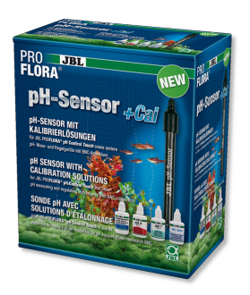
JBL PROFLORA pH-Sensor+Cal