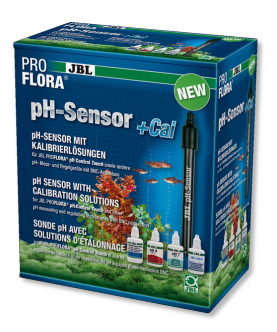
JBL PROFLORA pH-Sensor+Cal