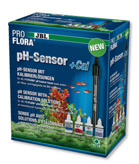
JBL PROFLORA pH-Sensor+Cal