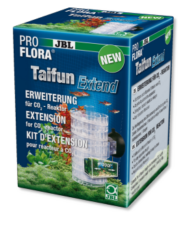
JBL PROFLORA Taifun Extend Extension for CO2 highperformance diffuser