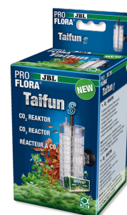
JBL PROFLORA Taifun S Extendable CO2 diffuser for small aquariums