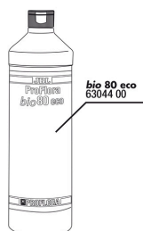
JBL bio80 eco reaction bottle