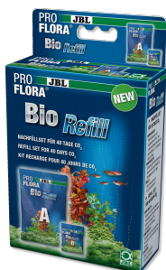
JBL PROFLORA BioRefill Refill set for bio-CO2 systems