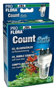
JBL PROFLORA CO2 Count Safe Bubble counter with backflow stop