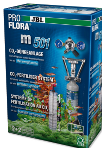
JBL PROFLORA m501 CO2 plant fertiliser system complete kit