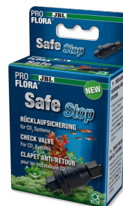
JBL PROFLORA SafeStop Water backflow stop for CO2 systems