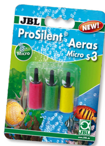
JBL ProSilent Aeras Micro S3 Air stone set for fine air bubbles in aquariums