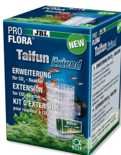
JBL PROFLORA Taifun Extend Extension for CO2 high-performance diffuser