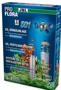
JBL PROFLORA u501 Plant fertiliser system complete kit