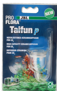
JBL PROFLORA Taifun P Mini CO2 diffuser for nano freshwater aquariums