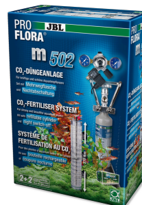
JBL PROFLORA m502 CO2 plant fertiliser system with night switch-off