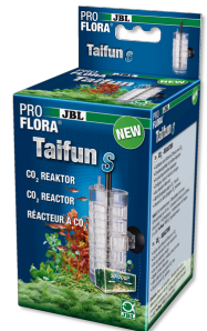
JBL PROFLORA Taifun S Extendable CO2 diffuser for small aquariums