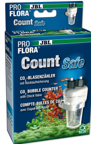
JBL PROFLORA CO2 Count Safe Bubble counter with backflow stop