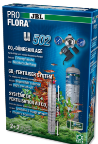
JBL PROFLORA u502 Plant fertiliser system with night switch-off