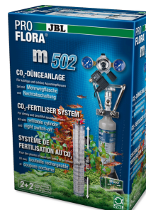
JBL PROFLORA m502 CO2 plant fertiliser system with night switch-off