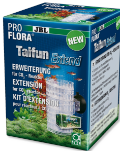
JBL PROFLORA Taifun Extend Extension for CO2 high-performance diffuser