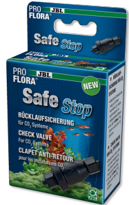
JBL PROFLORA SafeStop Water backflow stop for CO2 systems