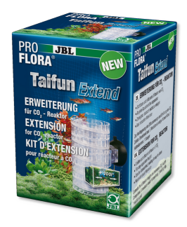
JBL PROFLORA Taifun Extend

Extension for CO2 high-performance diffuser