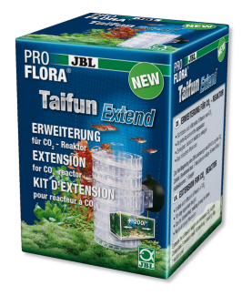
JBL PROFLORA Taifun Extend

Extension for CO2 high-performance diffuser