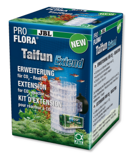
JBL PROFLORA Taifun Extend

Extension for CO2 high-performance diffuser