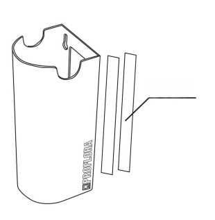
JBL Bio160 adhesive strip