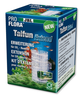
JBL PROFLORA Taifun Extend

Extension for CO2 high-performance diffuser