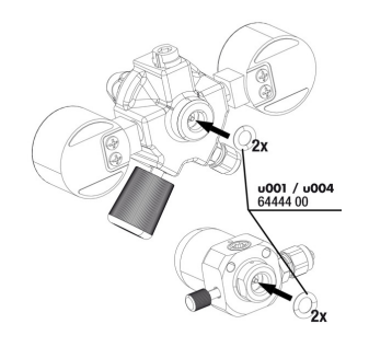
JBL ProFlora "u" O-ring seal