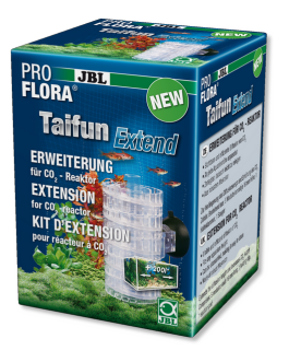
JBL PROFLORA Taifun Extend