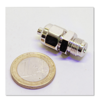
JBL tube screw connection 4/6 pressure reducer