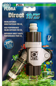
JBL PROFLORA Direct High performance direct diffuser for CO2