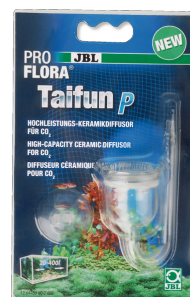
JBL PROFLORA Taifun P Mini CO2 diffuser for nano freshwater aquariums