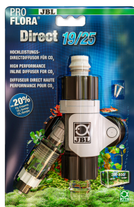
JBL PROFLORA Direct High performance direct diffuser for CO2