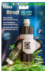
JBL PROFLORA Direct High performance direct diffuser for CO2