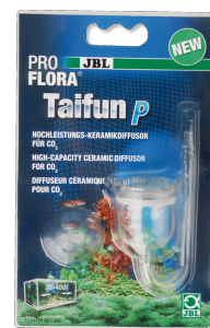
JBL PROFLORA Taifun P Mini CO2 diffuser for nano freshwater aquariums