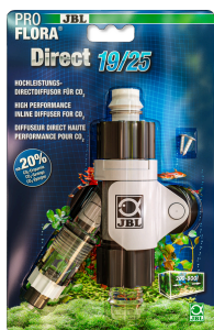
JBL PROFLORA Direct High performance direct diffuser for CO2