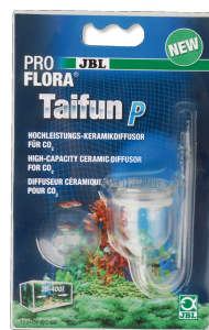
JBL PROFLORA Taifun P Mini CO2 diffuser for nano freshwater aquariums