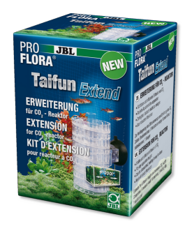
JBL PROFLORA Taifun Extend Extension for CO2 highperformance diffuser