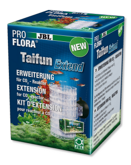
JBL PROFLORA Taifun Extend Extension for CO2 highperformance diffuser